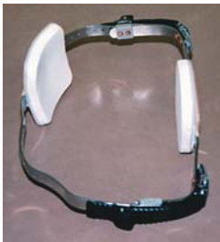
Pectus Carinatum Orthosis

"The two major systems affected by chronic Borrelia infection are musculoskeletal and nervous."