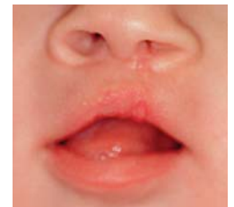
After initial surgery